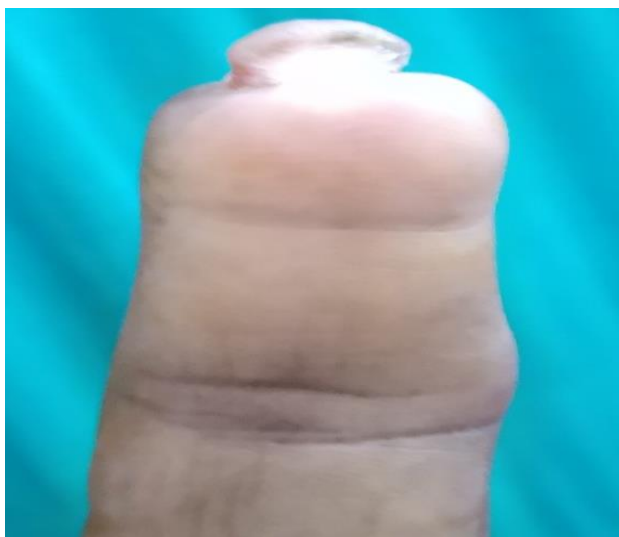
Figure 4: Post treatment of 60 days.