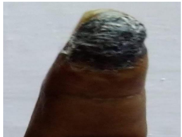
Figure 1: Pre treatment.

The clinical response in this case was excellent. At the first follow-up (15 th day) patient reported that affected skin began to leak a foul-smelling discharge within a week of treatment. At 30 th day; discharge ceased, flu-like and other symptoms like pain, burning, tingling sensations were disappeared and gangrenous part fallen off from index finger, followed by distal phalangeal bone was stripped (Figure 2). At 45 th day; the exposed distal phalangeal bone broken down automatically, and wound rebuild with new tissues made up of collagen fibers and eventually remodeling (maturation) of the tissues occurred (Figure 3). At 60 th day; the gangrenous wound of index finger completely healed and repaired (Figure 4). Hence there was debrided the damaged tissues through Unani medicine, without any surgical intervention like skin grafting and amputation. Above all medicines were found to be safe and effective.