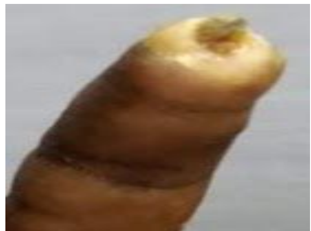
Figure 2: Post treatment of 30 days.