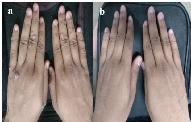
Figure 1: (a) Before immunotherapy, (b) after immunotherapy (3 weeks).