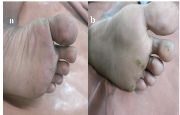
Figure 3: (a) After immunotherapy, (b) before immunotherapy (5 weeks).