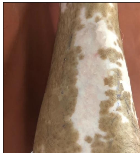
Figure 7: Group B - before treatment.