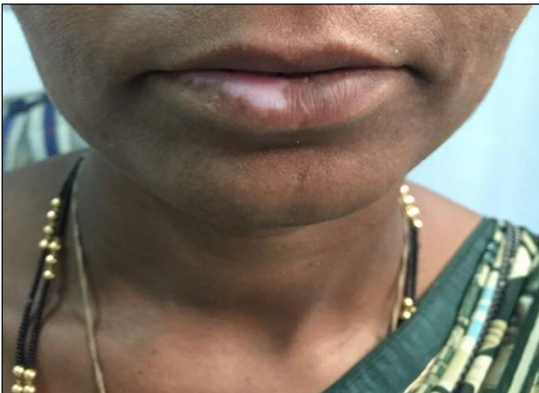
Figure 3: Mucosal vitiligo.