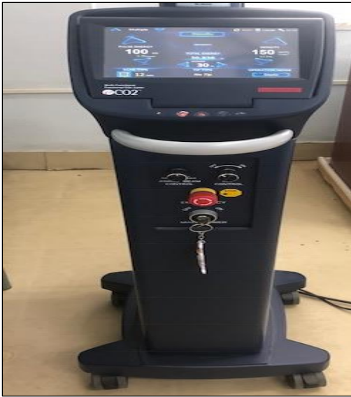
Figure 9: Fractional CO 2 laser.