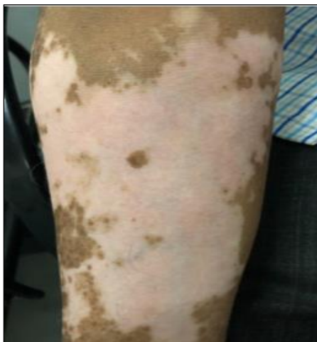
Figure 5: Group A patient - before treatment.

Out of 40 patients of vitiligo, 26 were females and 14 were males. The commonest age group seen was 20-30 years. Age of onset of vitiligo in this study ranged from 20-30 years. The commonest site of lesion was over lower limbs. Family history was seen in 4 patients. In this study vitiligo was seen in association with hypothyroidism in 2 patients. Previous treatment history was seen in 31 patients.