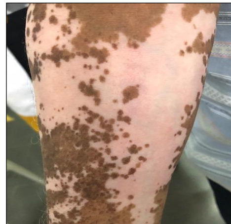
Figure 6: Group A patient - 12 weeks of treatment.

38% and 10% in group B. Marginal type of repigmentation was the commonest type in Group A and perifollicular in Group B. Erythema and was common side effect in Group A and pruritis in Group B.