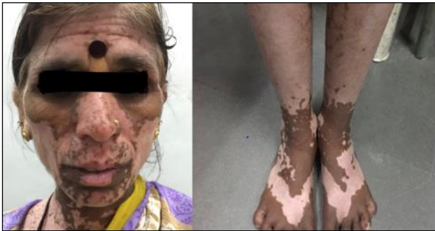
Figure 1: Generalised vitiligo.

Fractional CO 2 laser system is a recent advancement in the treatment of Vitiligo which works on the concept of Fractional photo thermolysis theory of laser skin resurfacing, in which microscopic treatment zones are created which help in increasing the penetration of topically applied agent which indirectly improves drug efficacy. The study was conducted to compare efficacy of fractional CO 2 laser, narrowband ultraviolet B (NBUVB), topical 0.1% tacrolimus ointment versus NBUVB and topical 0.1% tacrolimus ointment in patients with stable vitiligo.