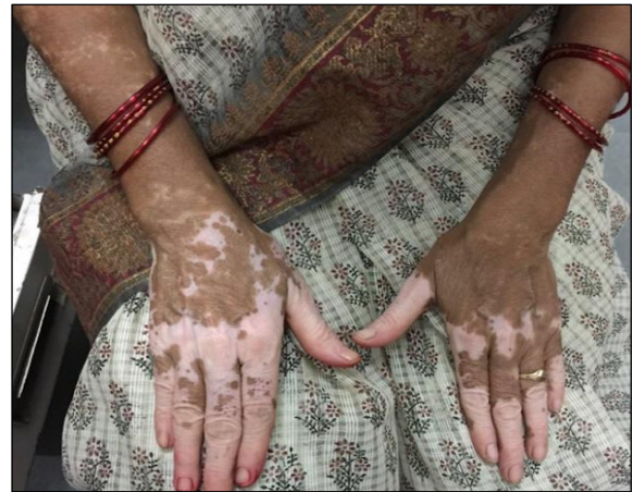
Figure 4: Acral vitiligo.