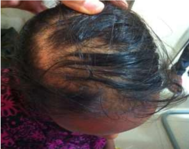
Figure 1: Diffuse hair loss with hair thinning over fronto-parietal area.

tests were normal while antinuclear antibody test was negative; a diagnosis of acute idiopathic telogen effluvium was made.