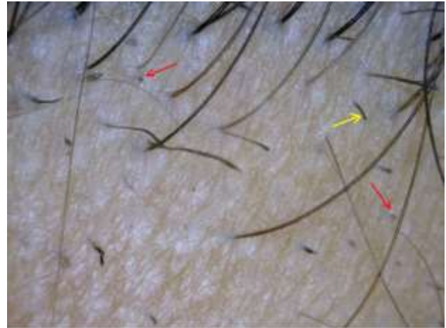
Fig. 4: Scalp dermoscopy showing broken hairs (yellow arrows) and Black dots (red arrows).

Histopathological examination was carried out from the parietal area of scalp which revealed a peribulbar infiltrate around some of the hair follicles. Taking the dermoscopic and histopathological findings into consideration a revised diagnosis of AAI was made.