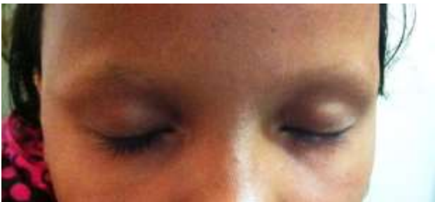
Figure 2: Bilateral loss of eyebrows.

On follow up after four weeks the diffuse alopecia over the scalp had progressed further and the patient had developed patchy hair loss over both eyebrows (Figure 2).