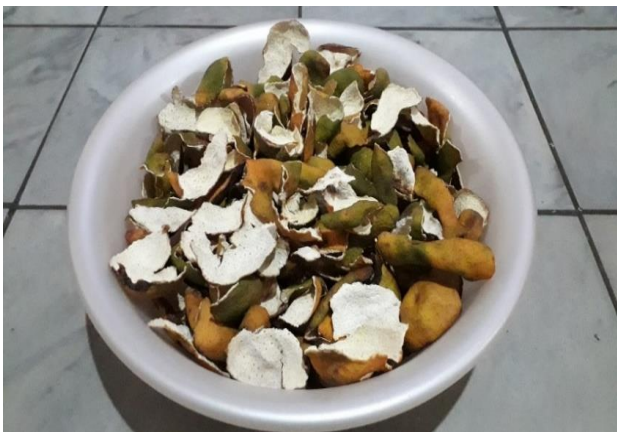
Figure 2: Tangerine peel.

Simplicia produced is as much as 800 grams. Then extraction by maceration method using 96% ethanol solvent. Maceration is done for 3x24 hours. Extraction results obtained from the tangerine peel from 700 grams simplicial to 129.48 grams of extract with yield extract is 18.49% (Table 1). The results of tyrosinase inhibition test can be seen in the figure 3. After the extract concentration was obtained with IC50 values, it was followed by optimization of the splash mask preparation base, with the formulation (Table 2).