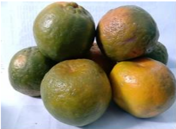
Figure 1: Tangerine fruit.

The tangerines are taken and the skin is made into simplicia (Figure 1). Material is processed into simplicia by means of material collection, wet sorting to separate impurities from tangerine peel and ensure that no fruit is damaged or rotten, then washing with running water to clean from dirt or dust attached to plants, stripping tangerine peels from the fruit, coarse chopping to reduce the size so it is easy to dry, the drying process is carried out with a drying cabinet, after drying dry sorting is done to separate from the material that is not good, then crushed with a grinding machine (Figure 2).