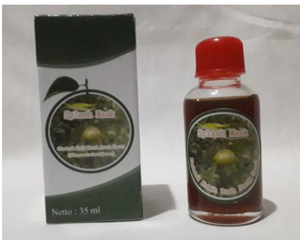
Figure 4: Splash mask with tangerine peel extract.

After obtaining the most stable base, then an inhibition test of the tyrosinase enzyme was carried out by the ELISA method (Figure 3). The test results of the tyrosinase enzyme inhibition activity were continued with a linear regression equation analysis test then determined the Inhibition concentration 50% tyrosinase (IC50). The IC value of inhibition of tyrosinase the result IC50 tangerin peel extract is 30.000 ppm with weak category and kojic acid 81,10 ppm with strong category (Table 4 and Table 5). The IC50 tangerin peel extract is higher than kojic acid, which is 30.000 ppm (tangerine) and 81,10 ppm (kojic acid). So, the lightening activity