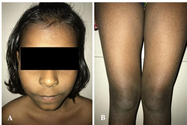
Figure 3: (A) Case of ichthyosis vulgaris; (B) lower extremities depicting ichthyosis vulgaris in same patient.

third case was of recessive X-linked ichthyosis presenting with xerotic skin over neck, abdomen and all four limbs sparing the palms and soles. This child had history of recurrent infection (5-6 episodes/year), preterm delivery and neonatal intensive care unit (NICU) admission for 15 days. His sibling was suffering from Chediak-Higashi syndrome.