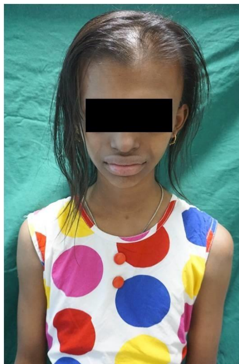
Figure 2: Ectodermal dysplasia.

Angiofibromas were the commonest cutaneous feature seen in all 6 cases of TSc (Figure 1) followed by Shagreen patch in 5 (83.33%) patients. CALMs and confetti macules were recorded in 2 (33.33%) cases each, while ash leaf macule was seen in 1 (16.67%) patient only. An association of Becker's nevus with TSc was seen in one case. Amongst the extra-cutaneous features, cortical tubers were present in 3 (50%) cases with history of convulsions present in one of them. Other uncommon manifestations included cardiac rhabdomyomas and renal angiomyolipoma in 1 (16.67%) case and retinal hamartomas were present in another (16.67%).