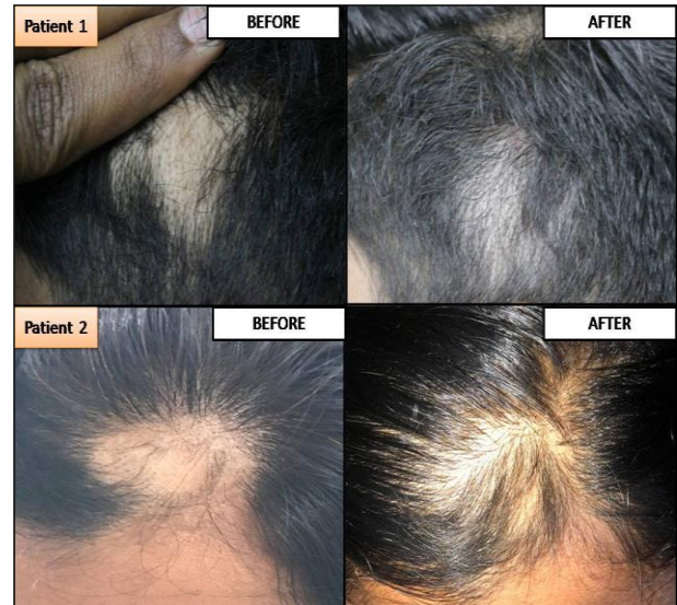
Figure 1: Group A patients on topical 0.05% betamethasone dipropionate cream.

In this study, 36% of the patients in Group B showed an RGS of 3 and 4 at the end of the 12 weeks with topical 0.05% tretinoin cream (Figure 2). These findings were similar to that done by Das et al. 5 4 patients in this group showed erythema with burning sensation which were temporary.