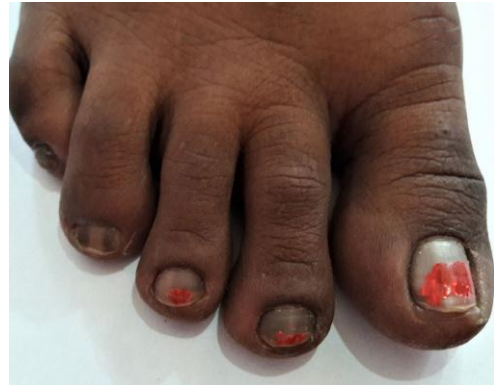
Figure 2: Longitudinal melanonychia over right sided toe nails.