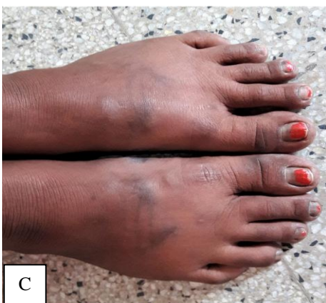
Figure 1: (A) Linear hyperpigmented streaks over neck, (B) left shoulder and (C) dorsum of bilateral feet.