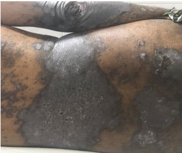
Figure 3: Healed lesions over the trunk.