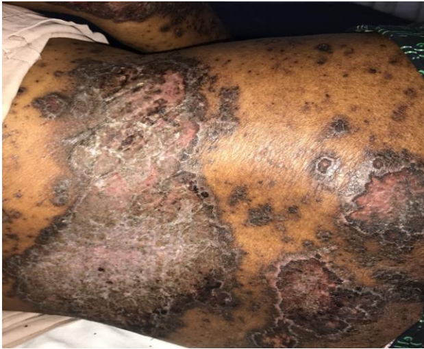
Figure 2: Multiple ulcerated plaques over the trunk.