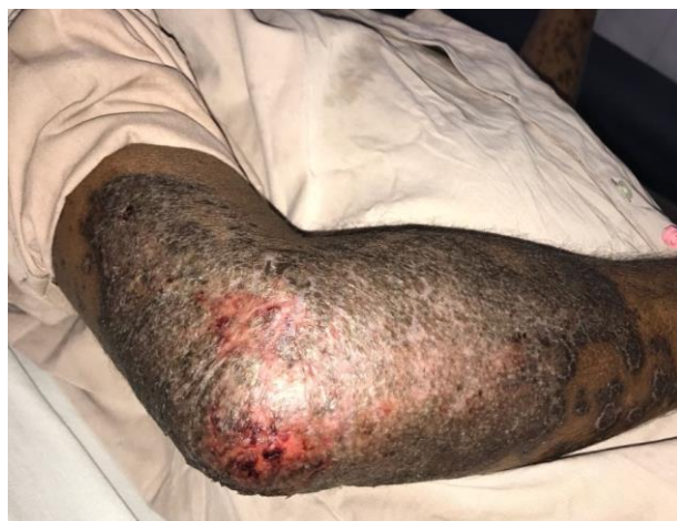
Figure 1: Ulcerated plaque over elbow.

examination revealed multiple well defined ulcerated plaques seen over the anterior and posterior aspects of the trunk, right forearm, extensor aspect of both thighs and legs.