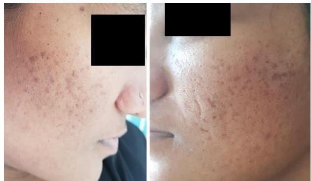
Figure 2: Acne scars (after treatment).