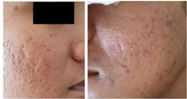
Figure 1: Grade 4 acne scar (before treatment).

In patients with grade 4 scars, 8 patients (57.1%) graded their response to treatment as very good with 50-74% in their acne scars and 6 (42.9%) patients had good improvement in their acne scars with 25-49% improvement. In patients with grade 3 scars, 6 (60%) patients graded their response as excellent with 75-100% improvement in their scars and 4 patients (40%) reported the response as very good with improvement between 50-74%. All 5 patients (100%) patients with grade 2 scars graded their response to treatment as excellent with improvement between 75-100%. Poor response with 0-24% improvement was reported by none of the patients. There is a significant improvement in scar grading in all patients who underwent treatment.