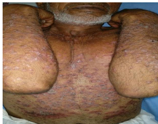
Figure 2: Psoriasis.

Among the pathological changes, papulosquamous disorders were seen in 62 patients (11.5%). Forty eight patients (8.9%) had psoriasis and 14 (2.6%) had lichen planus (Figure 2).