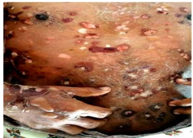
Figure 3: Pemphigus vulgaris.

Pigmentary disorders were seen in 65 patients (12.03%). Among the various pigmentary disorders, vitiligo was seen in 16 patients (2.9%), melasma in 49 patients (9.07%). The incidence of benign tumors exceeds the number of cases because most patients had more than 1 type of tumor, among the benign tumour cases, maximum 30.2% were the cases of cherry angioma, 23.5% were the cases of seborrheic keratosis, 21.7% were diagnosed for dermatosis papulosa nigra, 15.9% diagnosed for acrochordon and 0.4% and 0.7% were diagnosed for sebaceous cyst and syringoma respectively (Table 4C).