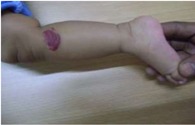
Figure 6: Capillary hemangioma solitary, well defined, scarlet red plaque seen on the right leg in a 3 month old girl since birth.

Among the congenital dermatoses (4.8%), maximum number of cases were of capillary hemangioma as in Figure 6 followed by congenital melanocytic nevi, nevus pigmentosus and a single case of spina bifida occulta.