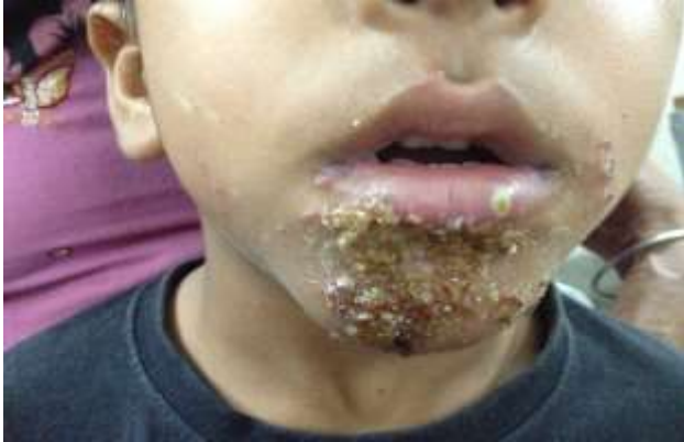
Figure 2: Impetigo contagiosa plaque with typical honey colored crusting on the chin of a 5 year old boy.

The pattern of bacterial infections was shown in Table 3. Of the total bacterial infections, incidence of impetigo as seen in Figure 2 was most common being 57.93%, secondary pyoderma 24.83%, folliculitis 11.72%, paronychia 3.45% and scrofuloderma was 3.07%. Of these 57.93% belonged to rural population and 42.07% belonged to urban population. The males (71.72%) largely outnumbered females (28.28%).