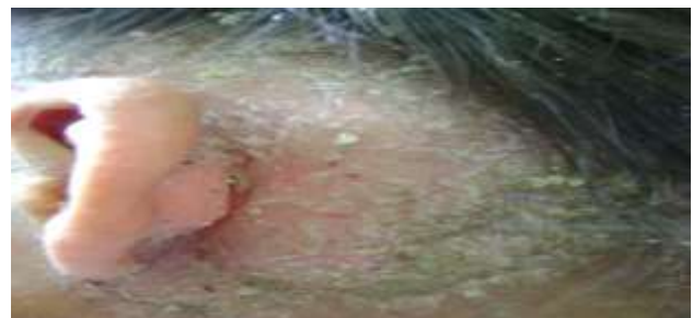
Figure 5: Seborrheic dermatitis- plaques with greasy scales seen over the scalp and retroauricular area in a 5 year old girl.

Eczematous disorders (35.1%) constituted the second most common dermatoses in the present study. Distribution of eczematous disorders is as shown in Table 4. Atopic dermatitis was the commonest entity comprising of 54.98% of this group. It was found to be more common in urban population with females outnumbering males. 102 out of 193 cases of atopic dermatitis had family history of atopy and 75 cases had personal history of atopy. The aggravating factors included winter season, woollen clothes, exposure to pets and sweating. The second most common entity in the group was seborrheic dermatitis (17.66%) as shown in Figure 5 followed by pityriasis alba (7.41%). Diaper dermatitis was seen in 4.85% cases. No statistical significant difference ( p value >0.05 ) was seen in distribution of eczematous disorders in urban/rural population and in sex distribution among the total cases.