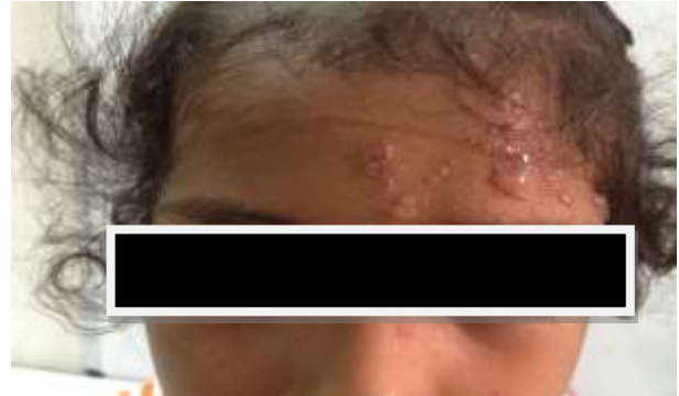
Figure 4: Herpes zoster grouped vesicles and bullae seen in dermatomal distribution over the left side of forehead, scalp and left eye in a 5 year old girl.

7.6% cases belonged to viral infections. Of these, Molluscum contagiosum was the predominant type seen in 69.74% cases, followed by warts (28.95%). A single case of Herpes zoster was seen Figure 4. Viral infections were common in rural population with 60% cases belonging to the same. Males outnumbered females with 76.32% cases being males.