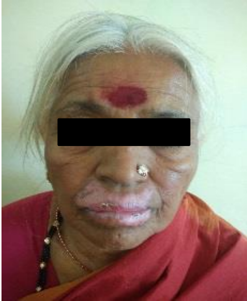
Figure 1: Erythematous plaques with adherent scales present over, both upper and lower lips and the area above the upper lip superimposed on the depigmented patch.

present over, both upper and lower lips and the area above the upper lip superimposed on the depigmented patch. A single depigmented discoid plaque measuring 0.5×0.5 cm with adherent scales and surrounding rim of hyperpigmentation was present over the left side of dorsum of nose. Scaly plaques with crusts and fissure were seen on the lips. Oral cavity showed a single shallow ulcer on the hard palate. Great toe nails were dystrophic. Other nails were normal.