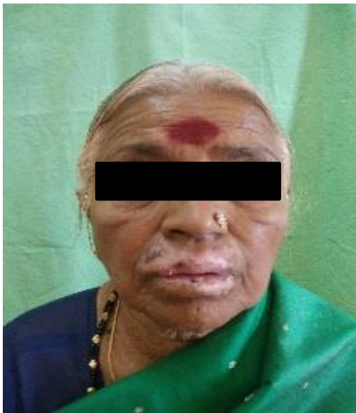
Figure 2: Lesion around the mouth showed resolution with decrease in erythema and scaling and the underlying vitiligo lesion around the mouth stood exposed.

Punch biopsy was done from the lesion over the scalp which showed thinned out epidermis with follicular plugging, hyperkeratosis, mild spongiosis, basal cell degeneration and dermo-epidermal junction showed band of chronic inflammatory cells comprising of lymphocytes and plasma cells extending around the follicles suggestive of discoid lupus erythematosus (Figure 4).