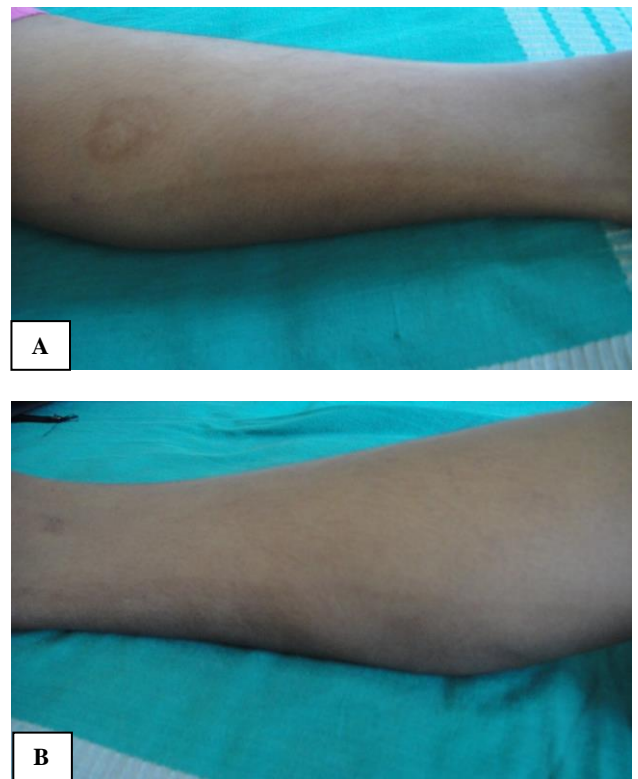
Figure 2: (A) Type B PDL, present bilaterally over the lower limbs; (B) Type B PDL seen over the right lower limb.

Type A PDL (Figure 1) was bilaterally symmetrical in 17 (89.4%) out of the 19 subjects who had this type of PDL and 2 (11.7%) were males and 15 (88.2%) were females.