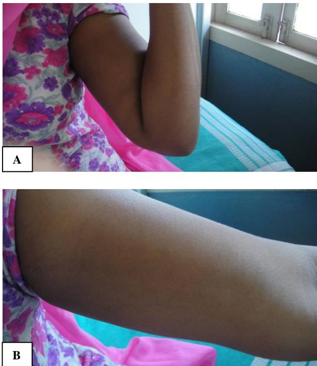
Figure 1: (A) Type A pigmentary demarcation line over the left forearm; (B) Type A pigmentary demarcation line over the left arm.

As shown in (Table 2), PDL Type A, Type B, and Type F were more common in females than males, and were seen in (32% vs 6%), (10% vs 4%) and (16% vs 6% respectively. Using Chi square test, p value was calculated, and was found to be very highly significant ( p < 0.001 ). PDL Type C was seen in 12 (24%) males, while Type G and Type H were seen in 2 (4%) females each.