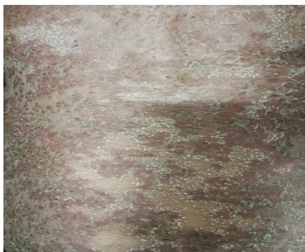
Figure 1: Generalized pustular lesions over an erythematous base and scaly plaques.

This is a report of a 33 year male that presented with the chief complaint of generalized itching, redness, and scaling over the body, in association with fever for one month. The lesions began over bilateral dorsae of hands, gradually extending to involve dorsae of feet, followed by abdomen, back, buttocks, scalp, face, bilateral arms and legs. Examination revealed the patient to be in erythroderma, with generalized pustular lesions over an erythematous base and scaly plaques (Figure 1) with only relative sparing of the chest. The oral mucosa showed presence of lingua plicata (Figure 2). No present or past history of pain or erythema in the oral mucosa and no history of any gastrointestinal disturbance. There was no present or past history of scalp scaling. There was no past history of similar lesions.