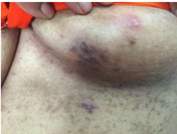
Figure 2: Multiple papules over a hyperpigmented base, a 1.5 by 1 cm ulcer secondary to rupture of a bullae over left breast and multiple brown discrete/confluent hyperpigmented macules over left inframammary region.

On histopathological examination widespread partial loss of cohesion between suprabasal keratinocytes are present, few keratinocytes are linked by few intact intercellular bridges-dilapidated brick wall appearance, the acantholytic cells have well defined nuclei and sharply lined cytoplasm, hyperkeratosis and moderate