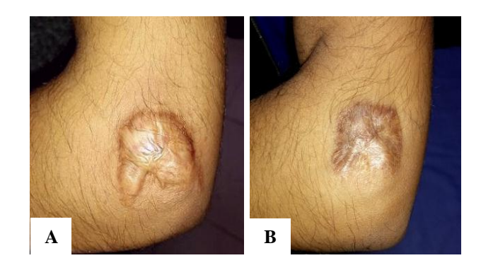
Figure 2: A= Before treatment; B= After 18 weeks of treatment (poor response).

Pain was the most common side effect as reported by 24 (96%) patients. None of the patients showed hypopigmentation, telengiectasia or atrophy (Table 6).