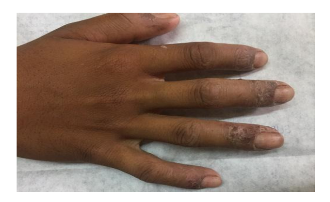
Figure 2: Multiple papulo-vesicles with crusting and scaling present over dorsum of right middle and ring finger.

Punch biopsy from lesion on right thumb was performed. On histopathological examination, epidermis showed hyperkeratosis, acanthosis, spongiosis, club shaped elongation of rete ridges. Focal areas showed subcorneal vesicle filled with neutrophilic debris and few areas showed ulceration covered by neutrophilic exudate (Figure 3). Dermis contained dense inflammatory infiltrate of neutrophils, eosinophils and lymphocytes.