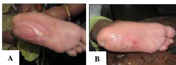
Figure 2: A=Trophic ulcer in patient of spina bifida; B=Healed ulcer after 8 weeks of platelet rich plasma in trophic ulcer.

No patient experienced any side effects due to the procedure.