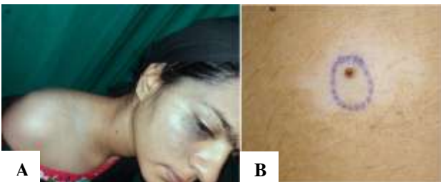
Figure 2: A) Greenish- blue macule over right shoulder region (nevus of Ito); B) central melanocytic nevus with peripheral depigmented macule (halo nevus).