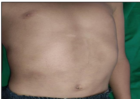
Figure 1: Well demarcated, non-tender, non-indurated, depressed pigmented plaque seen over centre of abdomen of size 10x7 cm, right side of chest of size 5x4 cm.

A 6 year old boy presented with depressed skin lesion involving trunk since 3 years. No history of previous trauma, drug intake, injections or prior inflammatory conditions. On examination, well demarcated, non-tender, non-indurated, depressed pigmented plaque seen over centre of abdomen of size 10x7 cm, right side of chest of size 5x4 cm (Figure 1) and over back of size 6x4 cm. A differential diagnosis of morphea and lipoatrophy was made. Routine hematological, biochemical investigations, fasting blood sugar, serum triglycerides, serum TSH and ANA were normal. Ultrasonography of depressed skin lesions showed thinning of subcutaneous plane with increased echoes in right posterior thorax.