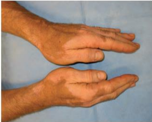
FIGURE Vitiligo. Sharply demarcated depigmented patches can be seen.

Considering the wide variety of medical treatments currently possible, dermatologists must assess their patients in a holistic way. 3,4