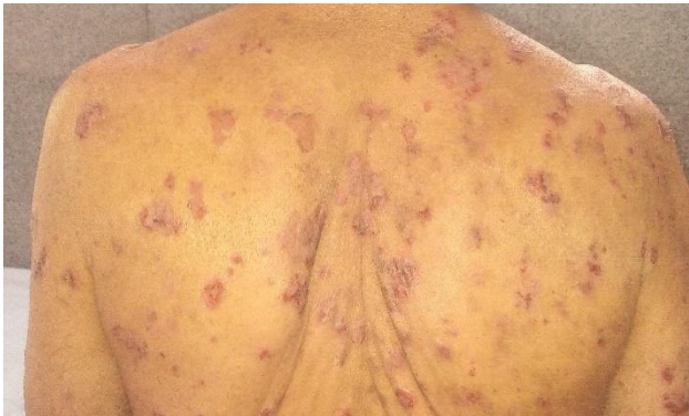
Figure 1: Pemphigus foliaceus-well defined superficial erosions topped with semi adherent hyperpigmented crusts over the back and chest.

Cutaneous examination showed multiple well defined superficial erosions topped with semi adherent hyperpigmented crusts over the back and chest (Figure 1). Nikolsky's sign (marginal and distant) was negative. The lesions over the lower extremities were few well defined erythematous plaques of various sizes with whitish adherent scaling, seen bilaterally symmetrically over knees and shins (Figure 2). Skin biopsy was taken from a plaque on the left lower extremity and crusted lesion over the back.