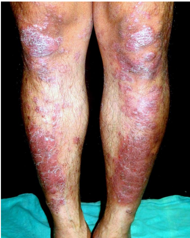
Figure 2: Psoriasis vulgaris-well defined erythematous plaques of various sizes with whitish adherent scaling seen bilaterally symmetrically over knees and shins.

Histopathology of leg lesion showed features of parakeratosis, hypogranulosis, Munro's micro abscesses,