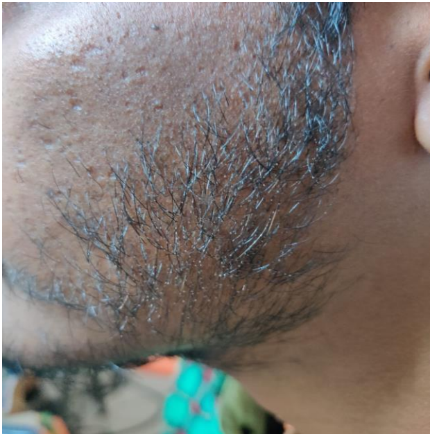
Figure 1: Multiple whitish nodes seen over the beard hair.

excessive salt water bathing, shampooing, setting and dyeing of hair. 3,5 It could also be due to malnutrition or endocrinopathy, especially iron deficiency and hypothyroidism. 6 TN can also affect brittle hairs with underlying structural weakness apart from normal hairs like pili torti, monilethrix, pseudomonilethrix and trichorrhexis invaginata which are more susceptible to trauma. 3 Characteristic presentation includes white flecking, dry and lustreless hair with abnormal fragility and inability to attain normal hair length because of premature breakage of the hair fiber. 1,4