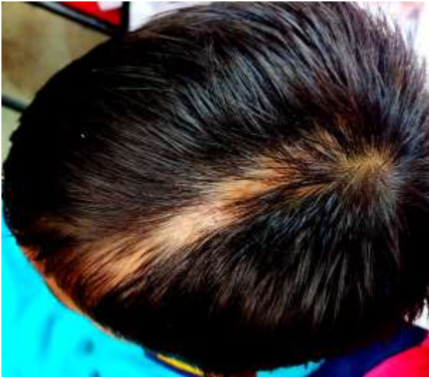
Figure 1: Before treatment.