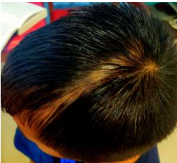
Figure 2: Hair regrowth after 1 month of treatment.

Skin biopsy from scalp revealed atrophic epidermis, diffuse and nodular lymphocytic and plasma cells infiltrates in the superficial and deep dermis. The subcutaneous tissue shows lobular inflammation with infiltrates composed of lymphocytes, histiocytes and plasma cells, with minimal septal involvement (Figure 3). ANA and anti-ds DNA were also negative. All routine blood investigations were normal.