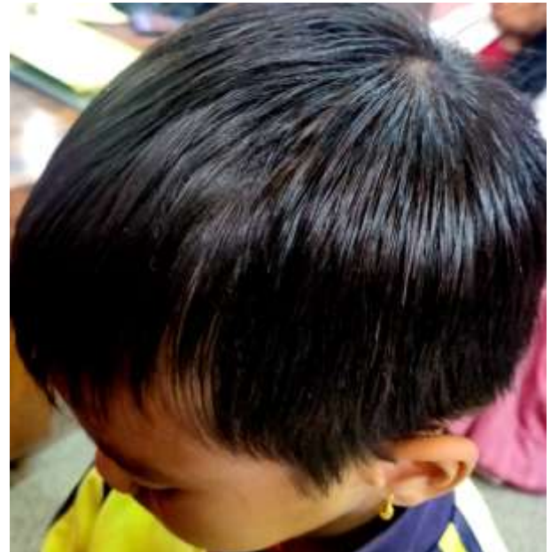
Figure 4: Complete hair regrowth seen after 5 months.