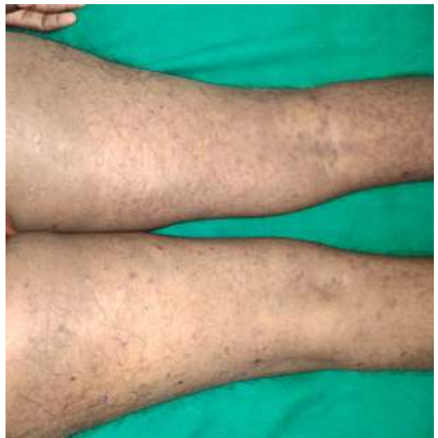
Figure 3: Petechiae over the posterior thighs.

He was started on intravenous antibiotics (ceftriaxone 1 gm IV 12 hourly, metronidazole 400 mg IV 8 hourly)