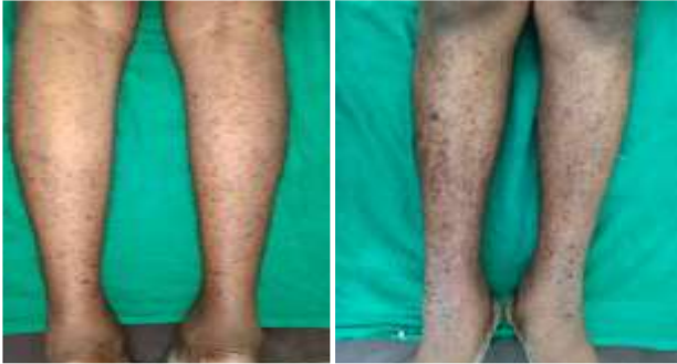
Figure 4: Petechiae over the legs.

along with prednisolone (0.75 mg/kg/day for 5 days) which was gradually tapered to 0.5 mg/kg/day as the existing lesions flattened and started resolving, Tablet hydroxychloroquine 400 mg twice a day and vitamin C supplements (Figure 6). Supportive measures like limb elevation and rest were also given. Gradually his abdominal and joint complaints regressed with marked improvement in lesions. Currently he is under regular follow-up.