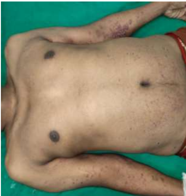
Figure 1: Multiple petechiae over the lower abdomen, arms with coalescing haemorrhagic vesicles with central necrosis and crusting.

blanchable purpuric papules distributed bilaterally over the lower and upper limbs, trunk, abdomen and back, palms and soles. Face was conspicuously spared. Deep dermal tenderness sign was positive. Edema with tenderness were present over hands and feet. Few coalescing haemorrhagic vesicles with central necrosis and crusting were seen on the left forearm (Figures 1-4). Mucosae were unremarkable. A week later, during his stay in the dermatology ward, he developed pain and swelling in both knee joints with abdominal cramps, bloody diarrhoea and burning micturition. Based on the history and clinical findings, we kept cutaneous small vessel vasculitis due to cutaneous LCV or adult-onset Henoch Schoenlein purpura as our differential diagnosis.