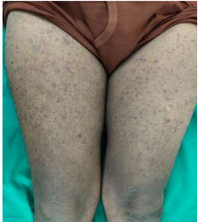
Figure 2: Petechiae over the anterior thighs.

consistent with the findings of leukocytoclastic vasculitis (Figure 5). Immunofluorescence and serum IgA levels could not be performed because of the financial constraints. A final diagnosis of adult-onset Henoch Schoenlein purpura was made based on EULAR criteria (European alliance of associations for rheumatology) criteria.