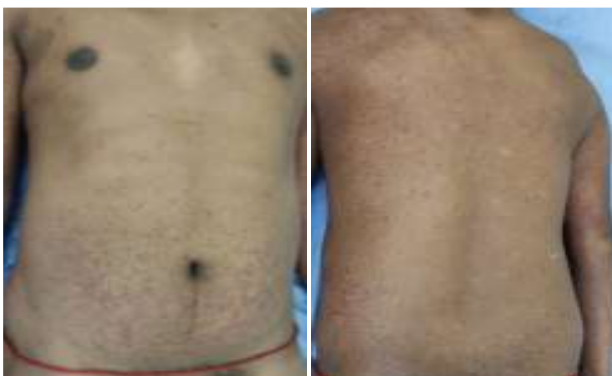
Figure 6: Resolution of lesions over the trunk and back.