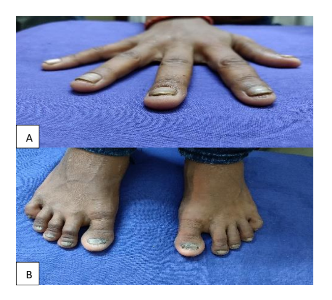
Figure 4: Significant reduction in nail discoloration, dystrophy, ridging and subungual hyperkeratosis after 6 months of biweekly oral prednisolone: (A) finger nails, (B) bilateral toe nails.