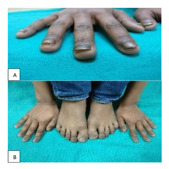
Figure 3: Nails showing blackish discoloration, dystrophy, ridging and subungual hyperkeratosis before treatment: (A) finger nails (B) Involvement of all twenty nails in the form of 'twenty nail dystrophies.

Figure 2: Significant hair re-growth noted after 6 months of pulse systemic corticosteroids: (A) on frontal and vertex region of scalp, (B) on occiput, (C) on frontal, parietal and temporal scalp on lateral view.