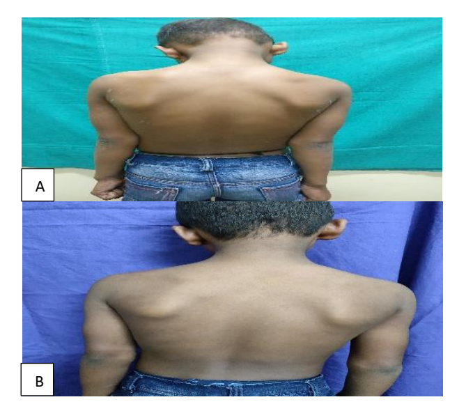
Figure 5: Multiple itchy violaceous scaly plaques on the back of neck, shoulders and upper back: (A) before treatment, (B) after treatment with oral pulse steroid therapy.