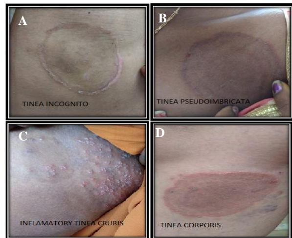
Figure 1: Various clinical types of tinea; A) tinea incognito, B) tinea pseudoimbricata, C) inflammatory tinea cruris and D) tinea corporis.

77% of the patients gave a history of delay in seeking medical help ranging from 2 weeks to 2 months. 19% of the patients had used home remedies in the form of oil, camphor or other irritants for their complaints before consulting doctors. Use of OTC drugs was seen in 46%. Out of which topical antifungal comprised 13.04%,