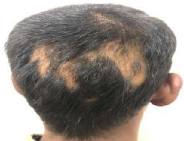
Figure 4: Multiple patches of alopecia areata over occipital region.

Dermoscopy findings noted in our study are as follows: - yellow dots are seen in 120 Pts (80%), black dots seen in 42 patients (28%), short vellus hair seen in 112 pts (74.7%), exclamation hair seen in 51 Pts (34%), and broken hair seen in 38 pts (25.3%) (Table 4) (Figure 1 and 3).