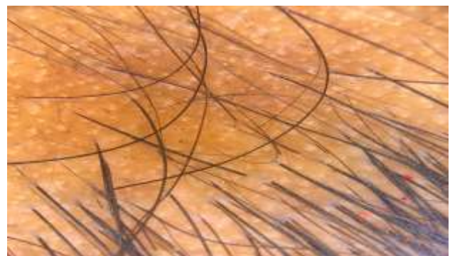
Figure 3: Dermoscopic image-yellow arrow showing tapering hair, blue arrow showing black dots and green arrow showing yellow dots.