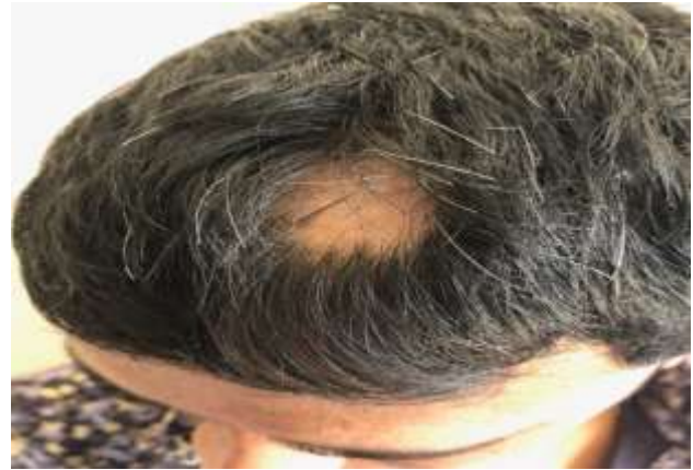
Figure 2: Solitary patch of alopecia areata in the fronto parietal region.