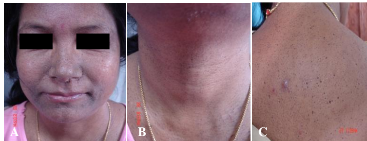
Figure 2: Dark keratinous plugs, (A) on face, (B) on neck and (C) on upper back. Mild slate-grey pigmentation of face and pitted scars in upper back.